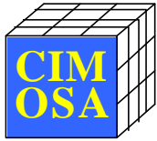
Table 1 (continued): Standards related efforts in Enterprise Engineering and Integration